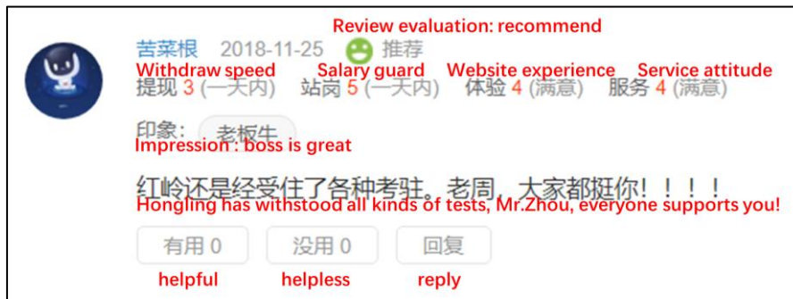
Figure 2 An example of review posted on WDJZ

Figure 2 shows a review posted on WDJZ. The sum of the four ratings of speed, guard, website experience, and service is used as the total rating of the platform.